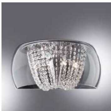
Audi 60 AP4 L 400 x H 210 x P 210 mm max 4 x 20W G4 / 230-240V