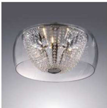
Audi 60 PL11 D50 ø 500 x H 230 mm max 11 x 20W G4 / 230-240V