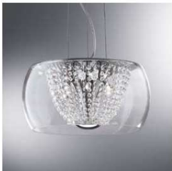
Audi 60 SP11 D50 ø 500 x H min 300 / max 1000 mm max 11 x 20W G4 / 230-240V