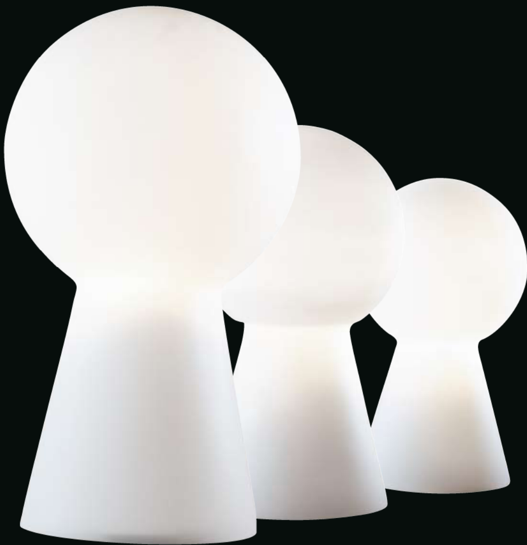
Birillo TL1 Big ø 300 x H 545 mm max 1 x 60W E27 / 230-240V

Blown glass table lamp. It works with two bulbs: one inside the base and one up. Diffused and indirect light emission.